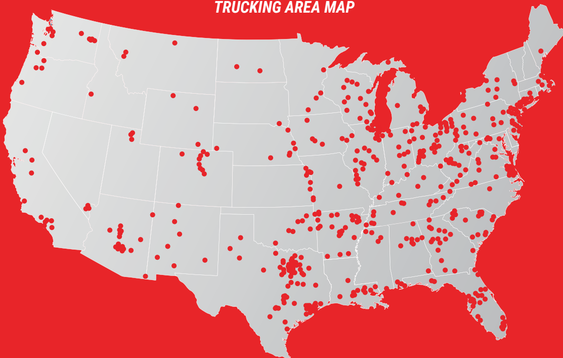
TRUCKING AREA MAP

For Emergency/After Hours Claims, please call our team at 913-901-6419 and they will assist you in getting the assignment handled. During Business Hours, we can also be reached at 800-354-5732.