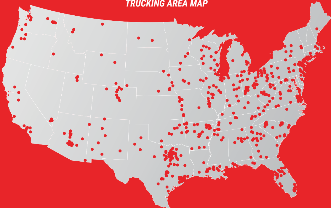
TRUCKING AREA MAP

For Emergency/After Hours Claims, please call our team at 913-901-6419 and they will assist you in getting the assignment handled. During Business Hours, we can also be reached at 800-354-5732.